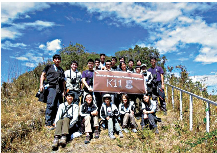
① "K11" Spice Up Series visit to Ecuador 「K11」Spice Up 系列往厄瓜多爾考察

自2009年起，「K11」與香港大學合辦「Spice Up 系列」，超過60名本地大學生到訪非洲及斯里蘭卡等具高生物多樣性的熱點。超過80%的參加者循不同途徑投身環保行業，可見計劃對香港未來的發展影響深遠。