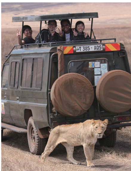
① "K11" Spice Up Series promotes ecological conservation and cultural appreciation among Hong Kong youth 「K11」Spice Up 系列提倡生態保育和培養香港青年對當地文化的欣賞