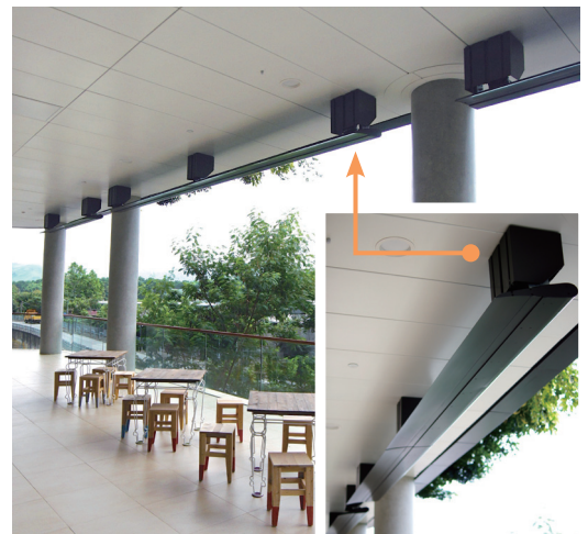
② Air Induction Unit (AIU), a patented, energy-efficient device, at "The Green Atrium" 「The Green Atrium」內的專利、高能效的「誘導式通風裝置」

"The Green Atrium", our sustainable lifestyle and learning hub, includes 32 sustainable building features under the categories of energy, air, water, food and waste. We seek to engage the surrounding communities and promote a green lifestyle.