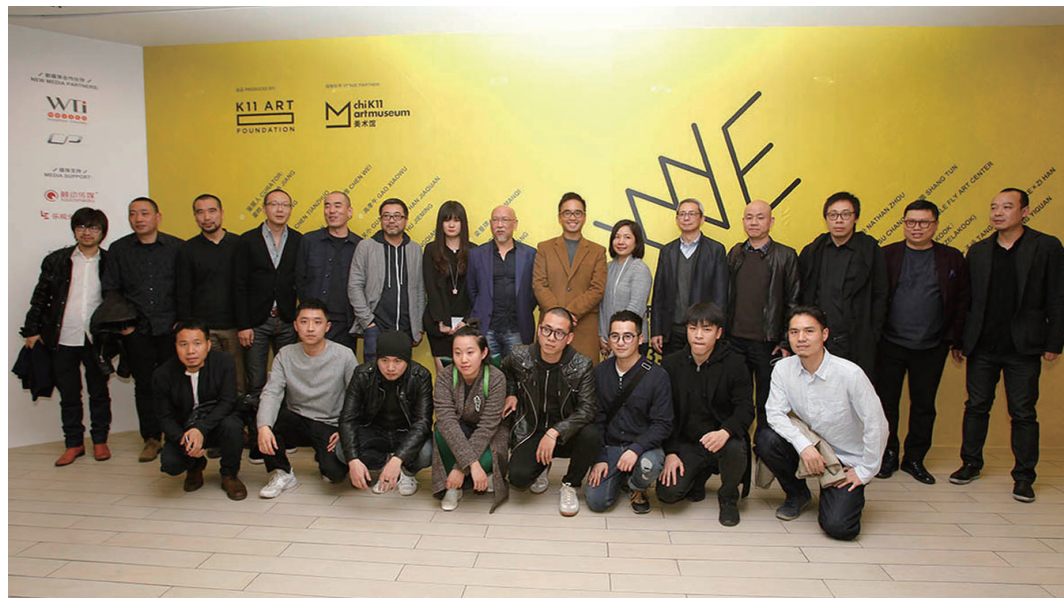
① A Community of Chinese Contemporary Artists at "Shanghai chi K11 Art Space" 在「上海chi K11藝術空間」舉行「我們：一個關於中國當代藝術家的力量」的開幕禮

K11 Art Foundation (KAF) 致力把新晉藝術家的作品帶到國際舞台，並培育大中華地區有潛力的年輕策展人。KAF於2016年協助巴黎龐比度中心(Centre Pompidou)尋找和委任一名來自香港的策展人。而「上海chi K11藝術空間」舉辦了開幕展覽，展出了56位當今中國藝術最具代表性的藝術家之作品。