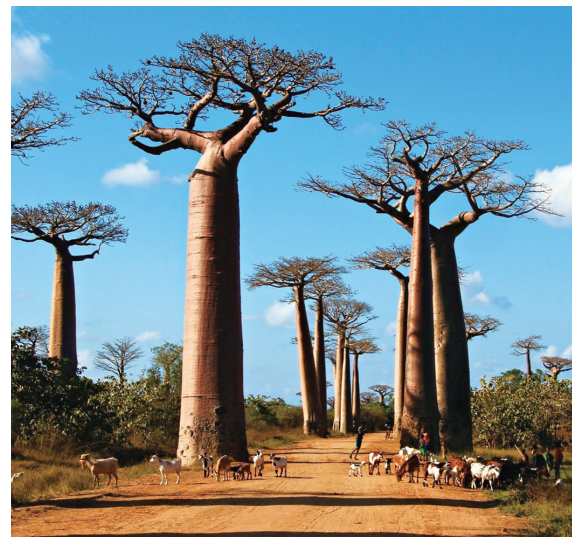
① "K11" Spice Up Series participants visiting biodiversity hotspots in Africa 「K11」Spice Up 系列往非洲生態多樣化熱點考察