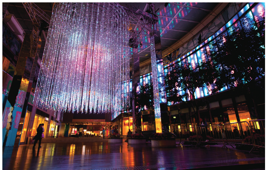
① Carbon neutral Christmas exhibition at "K11" in 2015 在2015年於「尖沙咀K11購物藝術館」舉辦的「碳中和」聖誕展覽