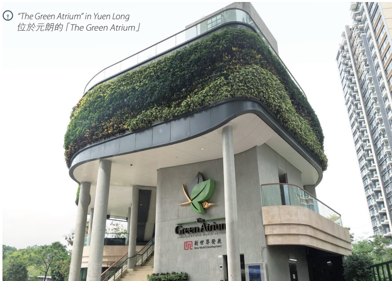
① "The Green Atrium" in Yuen Long 位於元朗的「The Green Atrium」

正在香港進行的發展項目中， 69% 的總樓面面積，等於約 57.6萬 平方米獲得BEAM或BEAM Plus綠建環評認證。